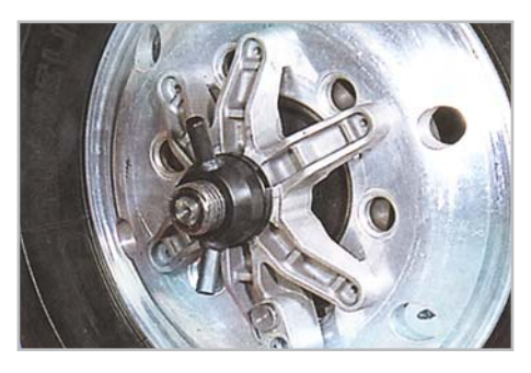
Adaptor assembly (220 – 280 mm Ø)