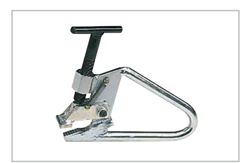
The mounting clamp, a strong aid

The bead breaker disc is equipped with a special tilting system in order to increase bead breaking effort and to make sure the bead breaking disc is always in optimum position relative to the rim.