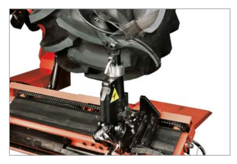
Mounting tool The mounting tool is adjustable by 180 deg. irrespective of arm position.

Clamping range of 4" – 58" without extensions - long jaws accommodate rims of high offset