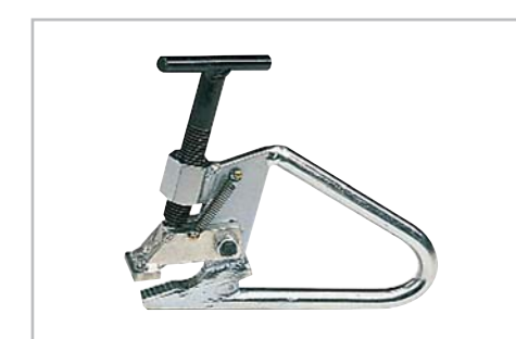
The mounting clamp, a strong aid