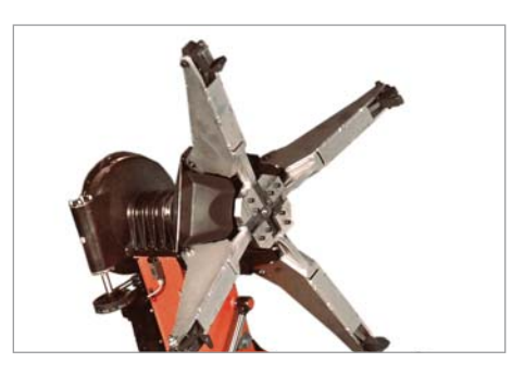
Extremely vast clamping range

Clamping range of 4" – 58" without extensions - long jaws accommodate rims of high offset