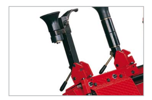
Accurate and gentle